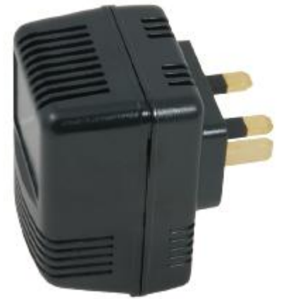
Illustration only: Supplied Product may differ