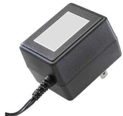
Illustration only: Supplied Product may differ