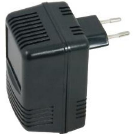
Illustration only: Supplied Product may differ